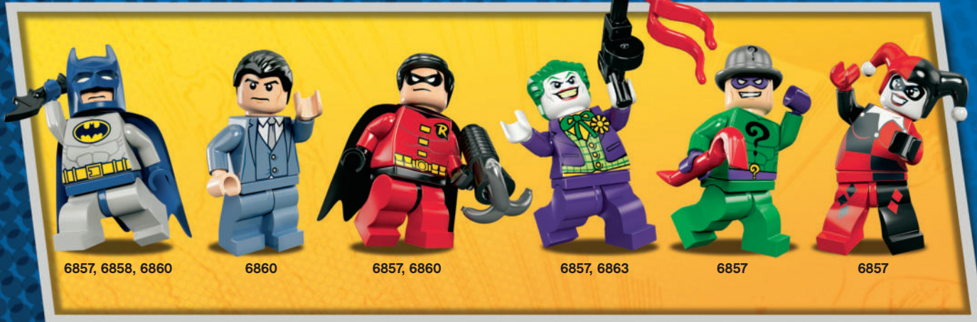
6857, 6858, 6860